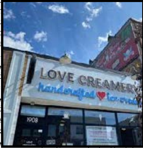
Love Creamery storefront located on W Superior St.

Searching for a list of this week's flavors? Check out some of the unforgettable flavors being scooped up at their Canal location. Salted Caramel (GF) Dark Chocolate (GF) Mint Chip (GF) Caramel Apple Pecan Pie (HG/N) Vegan S'mores (V/GF/S)